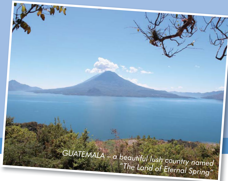
GUATEMALA – a beautiful lush country named “The Land of Eternal Spring”

“FOR I KNOW THE PLANS I HAVE FOR YOU DECLARES THE LORD, PLANS TO PROSPER YOU AND NOT TO HARM YOU, PLANS TO GIVE YOU A HOPE AND A FUTURE.” JEREMIAH 29: 1 1