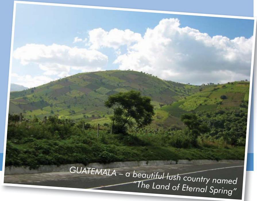
GUATEMALA – a beautiful lush country named “The Land of Eternal Spring”

“FOR I KNOW THE PLANS I HAVE FOR YOU DECLARES THE LORD, PLANS TO PROSPER YOU AND NOT TO HARM YOU, PLANS TO GIVE YOU A HOPE AND A FUTURE.” JEREMIAH 29: 1 1