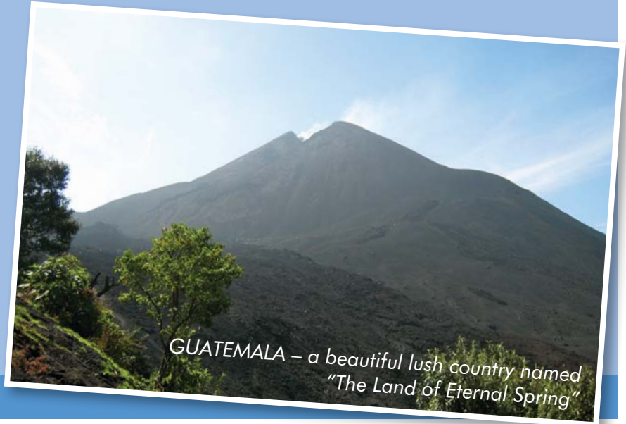
GUATEMALA – a beautiful lush country named “The Land of Eternal Spring”